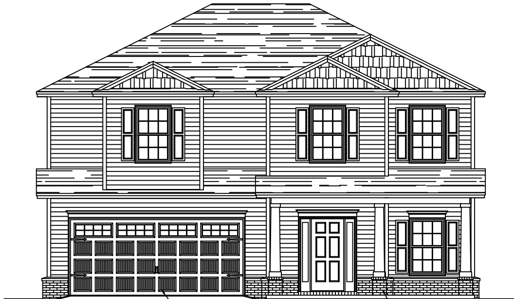
FRONT ELEVATION - B/A

SHOWN w/OPTIONAL CARRIAGE STYLE DOOR w/OPTIONAL GLASS