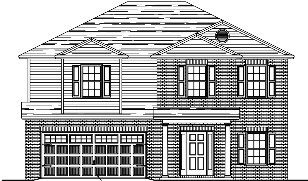
FRONT ELEVATION- B/C