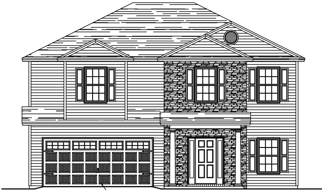
FRONT ELEVATION- B/D