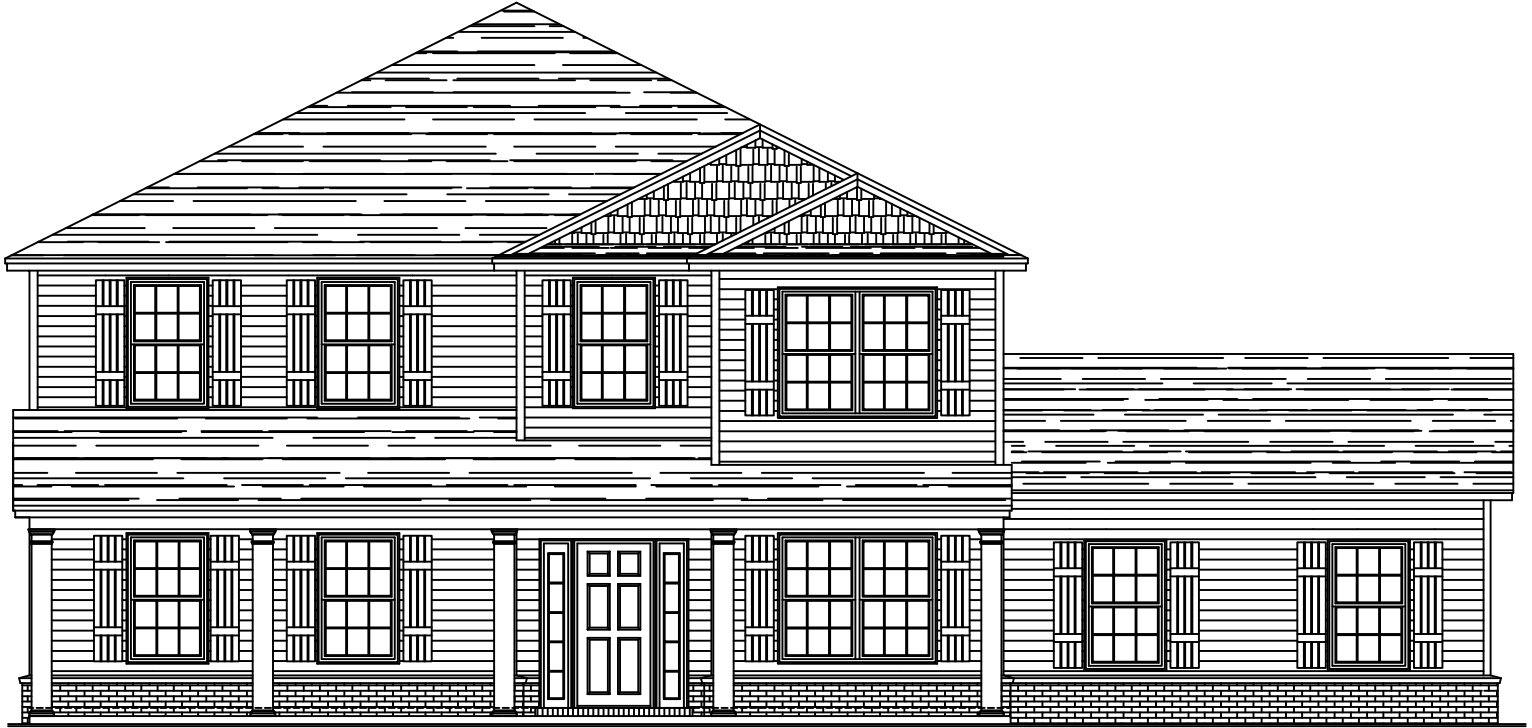
FRONT ELEVATION SIDE ENTRY GARAGE