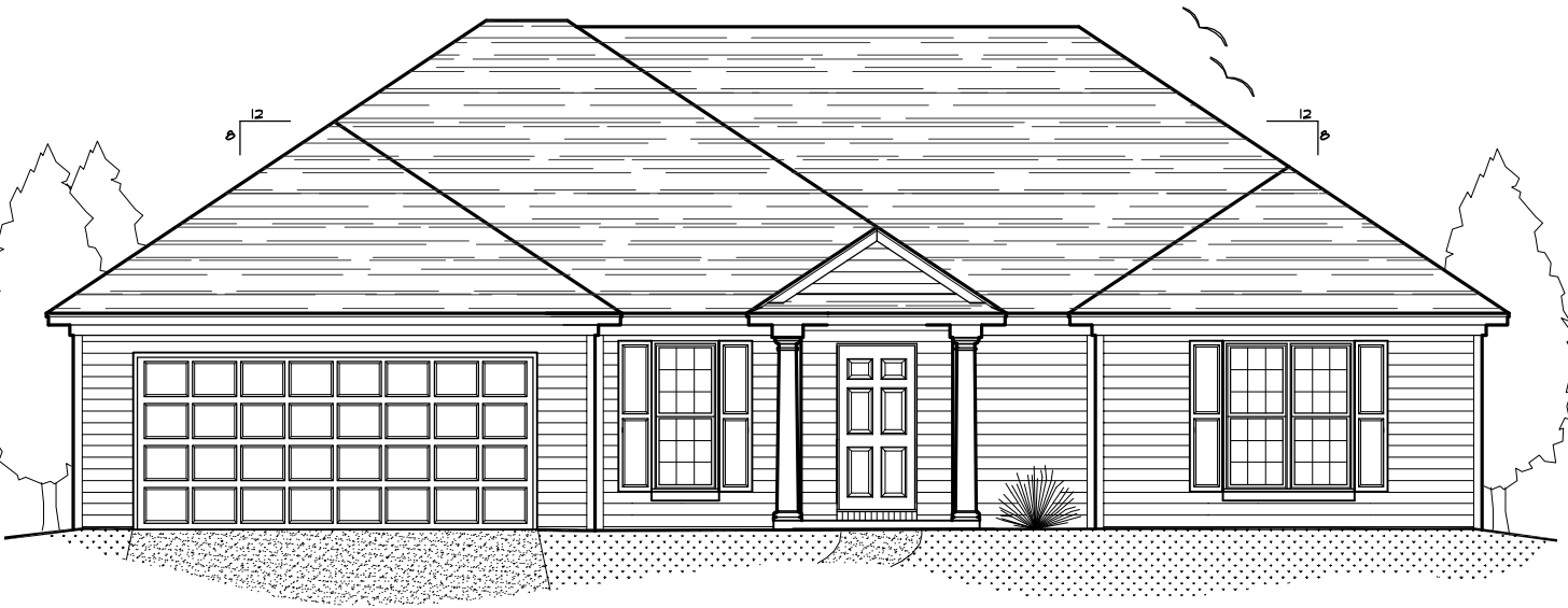
FRONT ELEVATION "A"