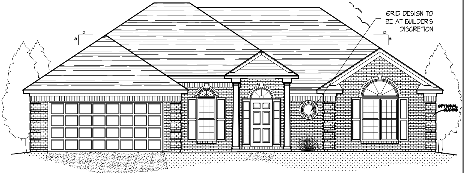
FRONT ELEVATION "C"