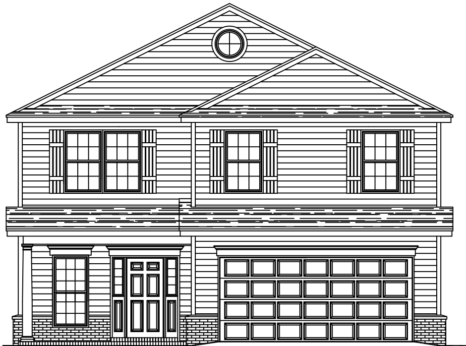
FRONT ELEVATION "D"