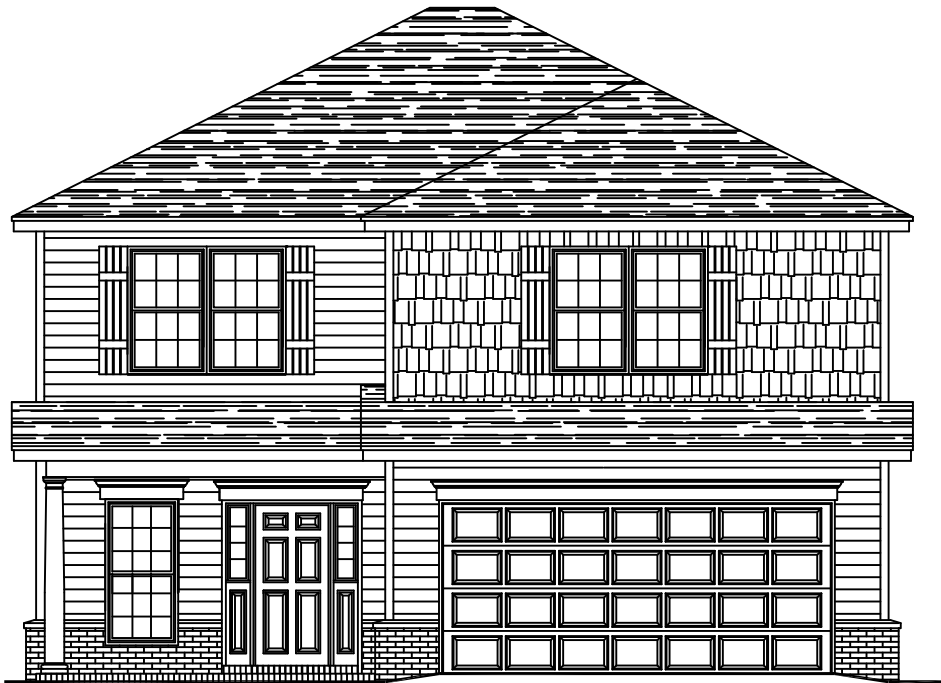
FRONT ELEVATION "B"