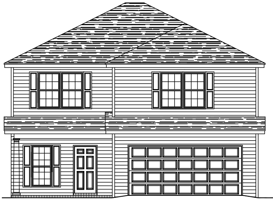
FRONT ELEVATION "A"