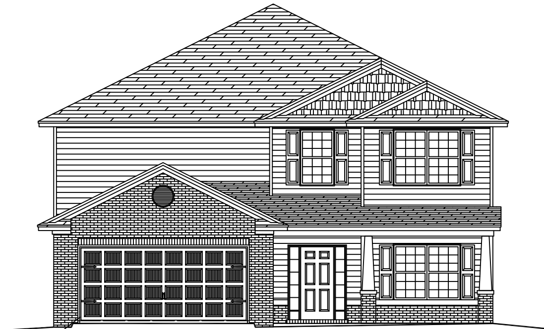
FRONT ELEVATION "C"