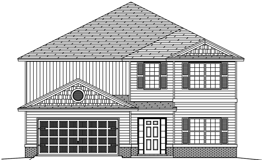
FRONT ELEVATION "A"